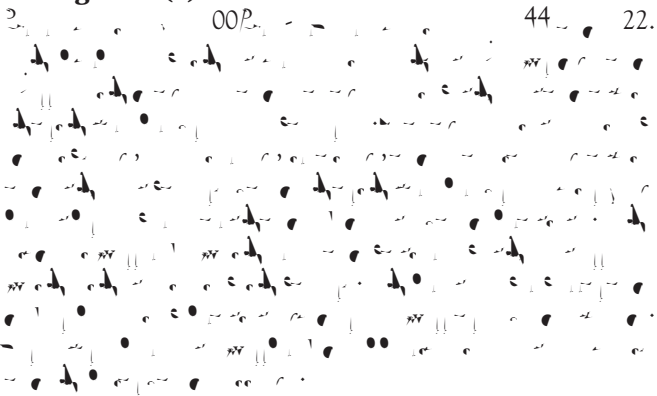
639. Primary Care of Family: Acute and Chronic Management (4)